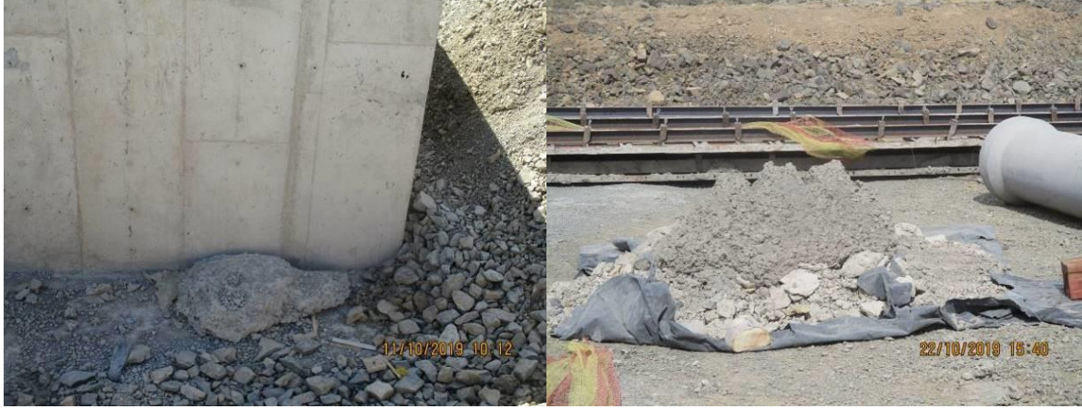
Photos: Unattended concrete waste (not properly cleaned or disposed).