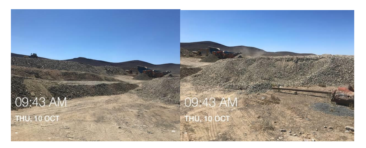
Photo: Location of imported material for wearing course where it is stockpiled.

Any fill material required on site must be sourced from a licensed commercial site suitable/permitted source, quarry or borrow pit. Where possible, material from foundation excavations must be used as fill on-site. G6 (import materials) used as final layer or wearing course are source from approved quarry registered under Swartbult Trust IT 4336/96, Zandrivier: permit number 02/2015 and Elandvlei sand mine: permit ML19/96 and when there is a need other import materials will be also sourced from approved quarry at Brewelskloof (ERF 3604, Worcester, Western Cape) registered by Afrimat Aggregates PTY (Ltd) previously known as Prima Klipbrekers PTY (Ltd) under Mineral and Petroleum Development Act, No 28 of 2002. 4598, 16 m³ of import materials used for wearing course from Swartbult Trust IT 4336/96 was delivered on site for the reporting month.