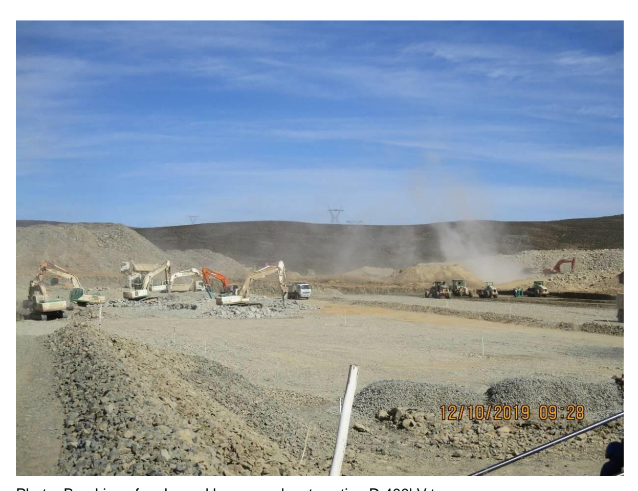
Photo: Breaking of rocks and layers works at section D 400kV terrace.