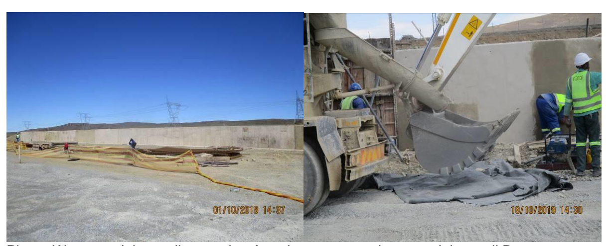
Photo: Water retaining wall at section A and concrete works at retaining wall B.